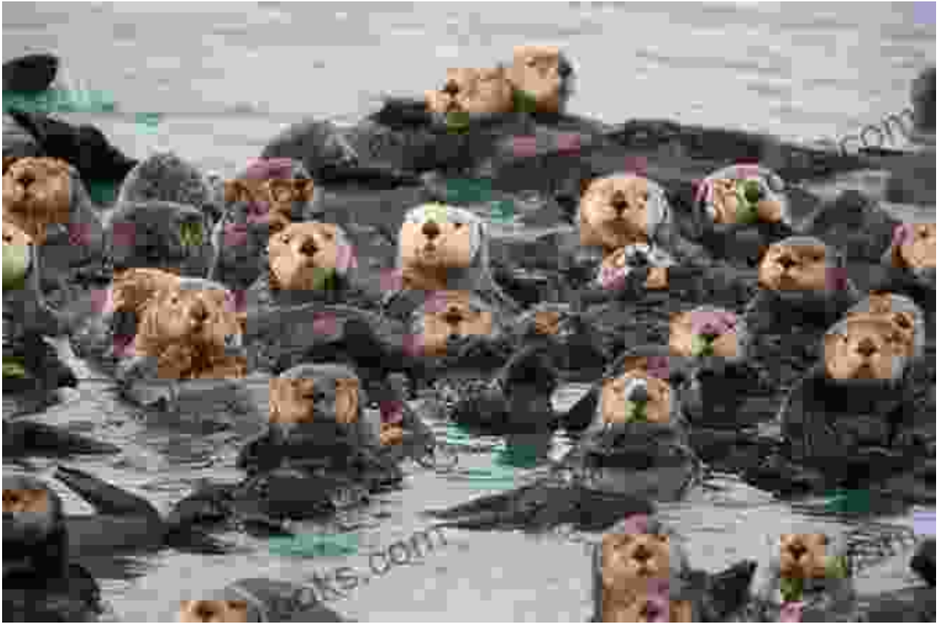
Otters in Massachusetts