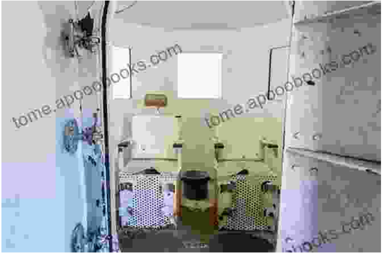
The chilling gas chamber where countless inmates met their fate.