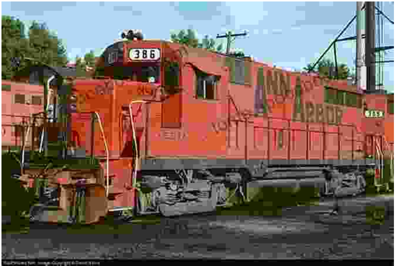
Freight locomotive, number 386, at the Anaheim Arbide.