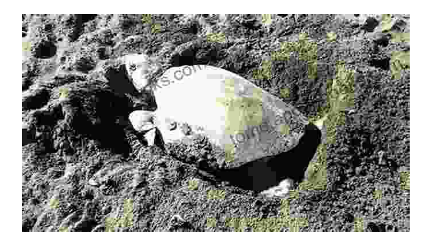
The Cycle of Life: From Hatchlings to Maturity