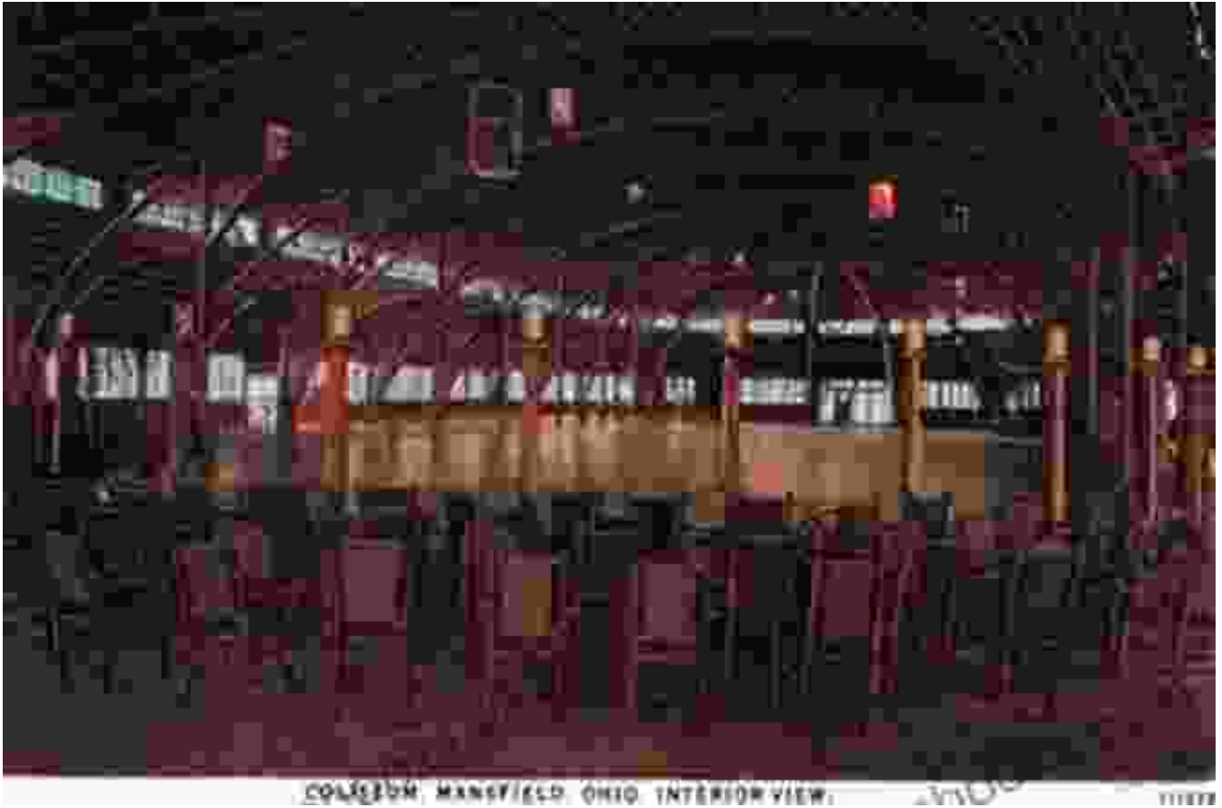
COLISEUM, MANSFIELD, OHIO. INTERIOR VIEW.