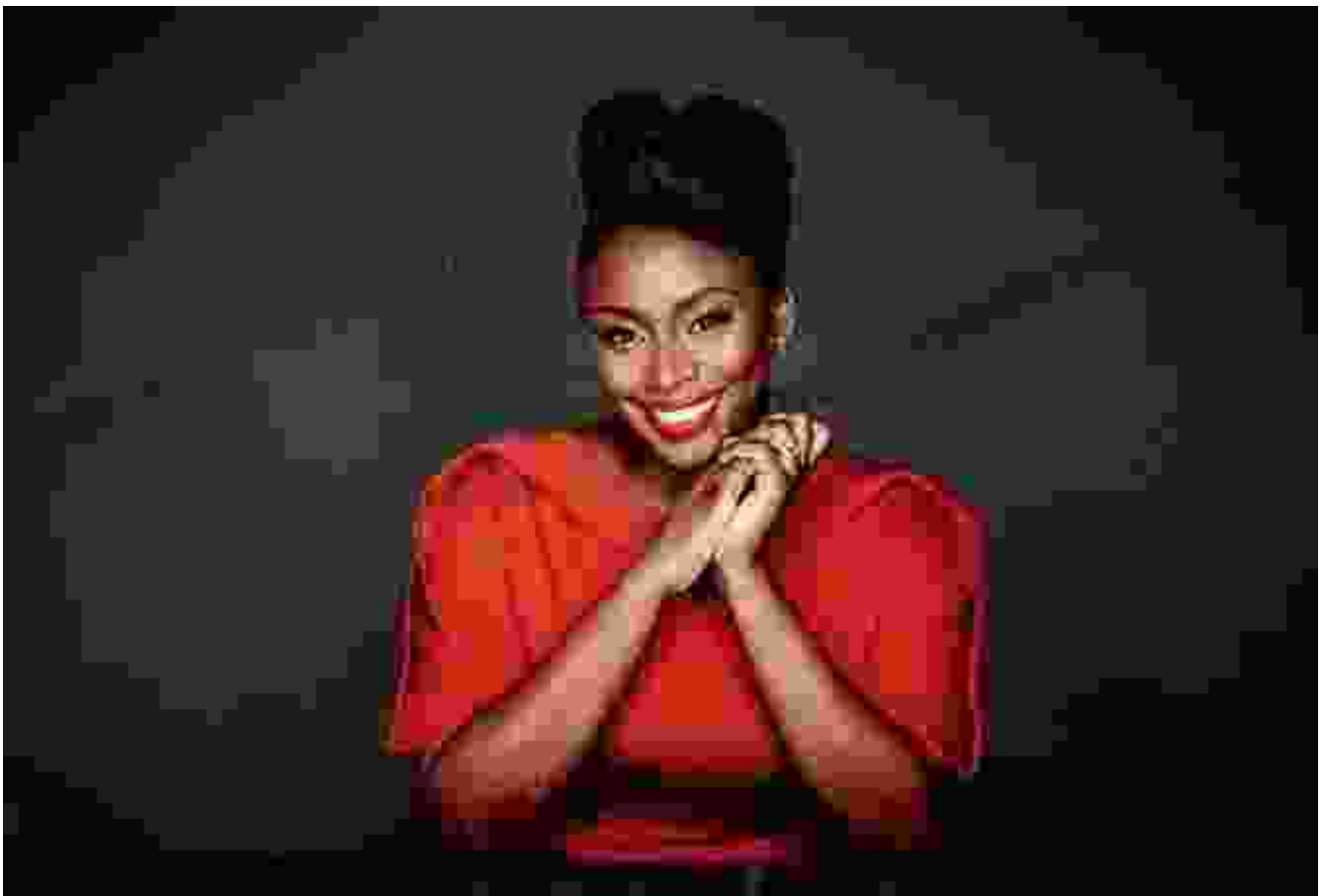
Chimamanda Ngozi Adichie

Chimamanda Ngozi Adichie's powerful essay, "We Should All Be Feminists," has become a global phenomenon. Adapted from her TEDx talk