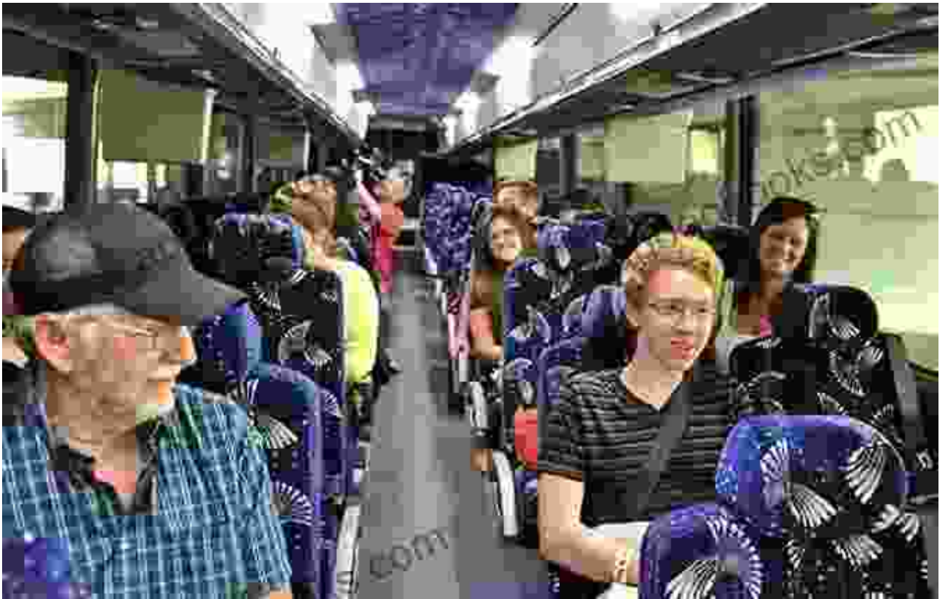
A glimpse into the daily life of Edinburgh's 1970s commuters

'Edinburgh Buses of the 1970s' is not merely a historical account; it is also a collection of nostalgic anecdotes and vivid imagery. Walter draws upon personal recollections, interviews, and archival photographs to create a rich tapestry of stories and experiences that bring the era to life.