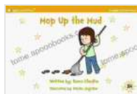
Image Alt Text: Book cover of "B4 Mop Up The Mud" with a vibrant sunrise and a person reaching for the sky.